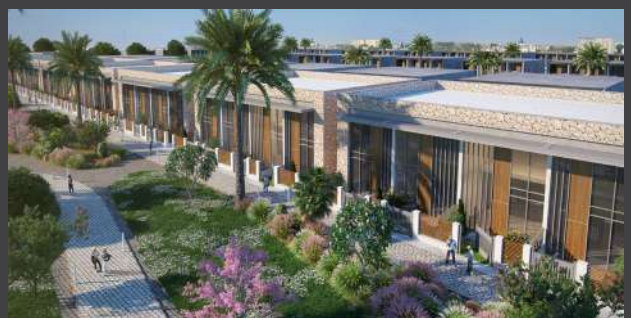
Villas Overlooking the Central Park